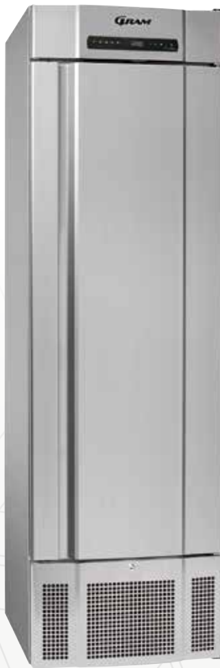
BioMidi EF425. Drawers are optional extras.

The BioMidi EF425 cabinet is a low temperature freezer that operates in the temperature range -5/-40^{\circ}\text{C} . It is a high capacity ventilated refrigeration unit that makes sure the interior quickly returns to the specified temperature after the door has been opened.