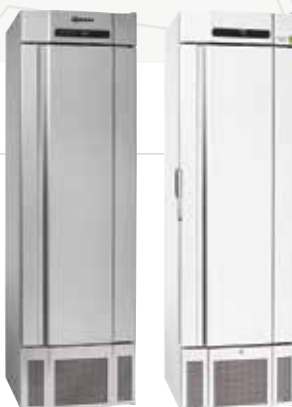
The BioMidi EF425 is available in either white or stainless steel finish. All models come with selfclosing door.

The functional design ensures easy, ergonomically correct access to the storage space.